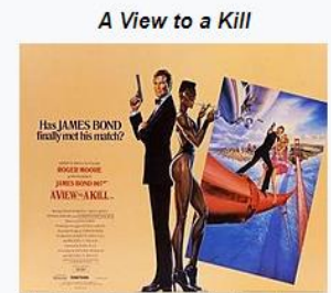
Theatrical release poster by Dan Gouzee